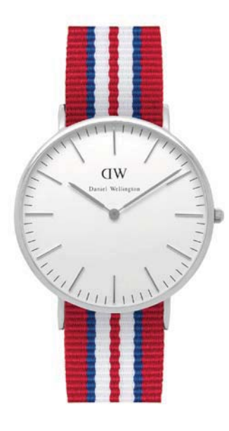
WATCH: 40MM SILVER STRAP: EXETER 0212DW

WATCH: 40MM SILVER STRAP: CAMBRIDGE 0203DW