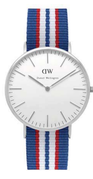
WATCH: 40MM SILVER STRAP: BELFAST 0213DW