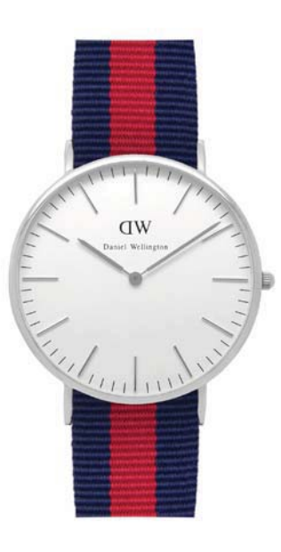
WATCH: 40MM SILVER STRAP: OXFORD 0201DW

WATCH: 40MM ROSE STRAP: CANTERBURY 0102DW