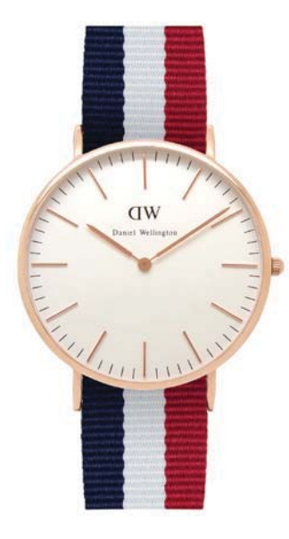
WATCH: 40MM ROSE STRAP: CAMBRIDGE 0103DW