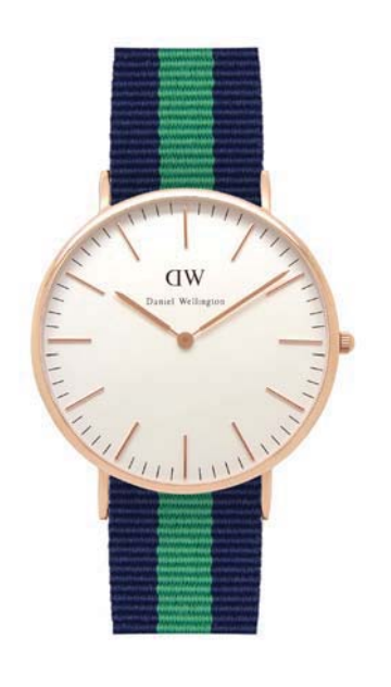
WATCH: 40MM ROSE STRAP: WARWICK 0105DW

WATCH: 40MM SILVER STRAP: NOTTINGHAM 0208DW